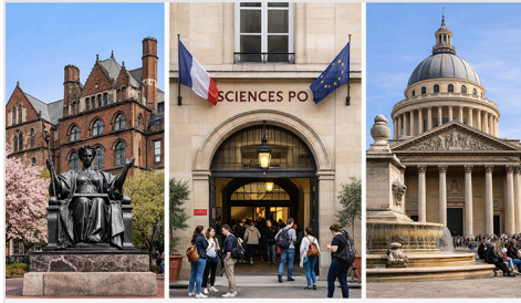
Inter-University Research Conference Global Governance and Comparative Policy Studies in Education