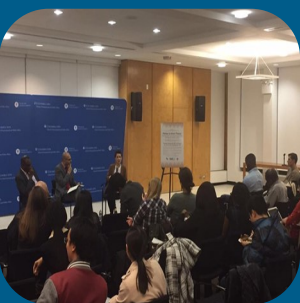
Panel discussion on Radicalization of youth in Africa