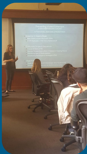
Human Rights Education Curriculum Launch