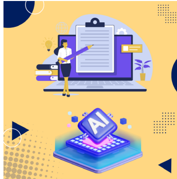
Tips & Tricks for Prompt Writing with Generative AI