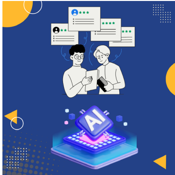
Using AI to Receive Feedback on Your Work

The DFI Masterclass Series offers engaging webinars that delve into the latest trends and topics surrounding various technology tools. This past semester, we focused on Artificial Intelligence and the various ways you can utilize Large Language Models (LLMs), as either an instructor or student. Discover the insights and practical applications showcased in our three Masterclass Webinar videos below: