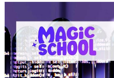
Magic School Review