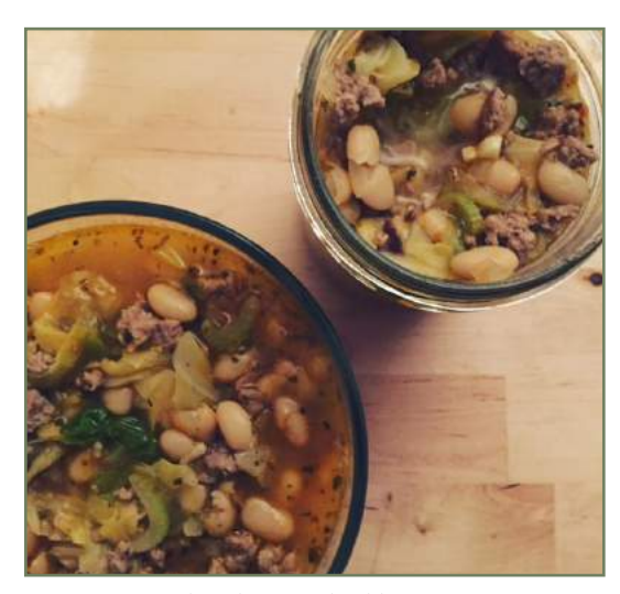
White bean and cabbage soup