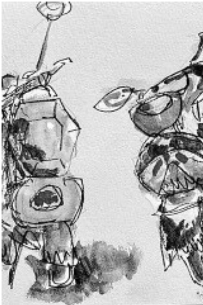
Exhibit Zankel 214

Here at Teachers College, Columbia University, we continue to do the work of ethnography as a means to educate democratically. We pay attention to what people are doing to educate themselves about the world around from seafaring villages, to nursery rooms, to urban street corners, to elderly singing choirs—spaces far removed from classrooms. Our exhibit showcases photographs, sketches, drawings, audiovisual materials, sounds, and artifacts collected, generated and/or produced by faculty and students who are currently doing this kind of work at Teachers College. The exhibit is open to all of Columbia University and the New York City consortium of social science and humanities departments, and will run for the duration of the 4th Biennial Anthropology and Education Conference, October 20th and 21st.